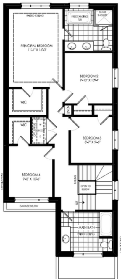
OPTIONAL UPPER FLOOR PLAN ELEVATION 'C' W/ 4 BEDROOM